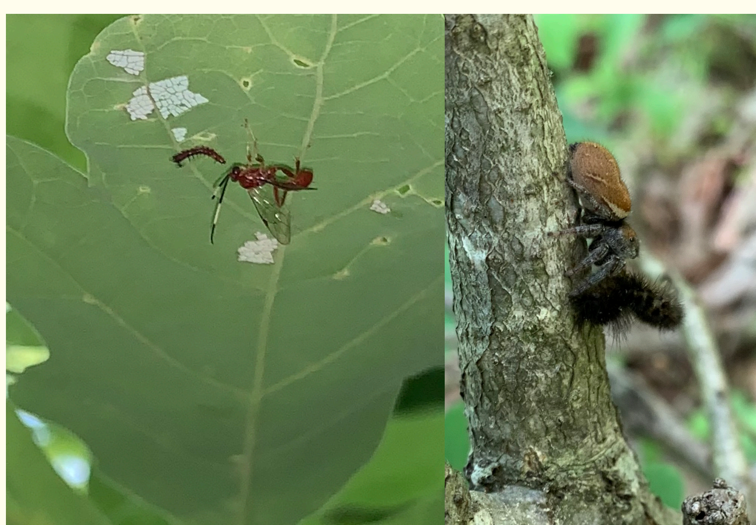
Fig. 2. A parasitoid wasp ovipositing into a caterpillar (left), and a camera-shy salticid spider eating a gypsy moth (right).