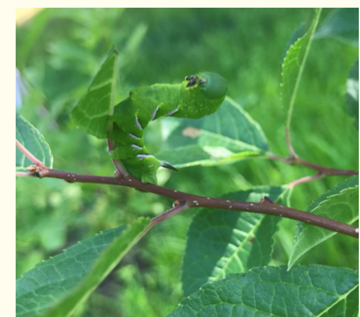
Fig. 4. A pawpaw sphinx moth caterpillar ( Dolba hyloeus ) masquerading as a leaf on one of its hosts, winterberry holly ( Ilex verticillata )

Insect herbivores may possess morphological and behavioral traits that enable them to be camouflaged to their specific host plants. Our review found that specialist insect herbivores are more effective at utilizing camouflage on their hosts than generalists, as predicted by the enemy-free space hypothesis. The morphological match between insect and plant was better for specialists even though some generalists can develop specific camouflage through polyphenism. More stereotypical hiding behavior on specific parts of the host plant was seen as evidence for superior behavioral camouflage by specialists. Both the morphological and behavioral camouflage traits predicted reduced predation.